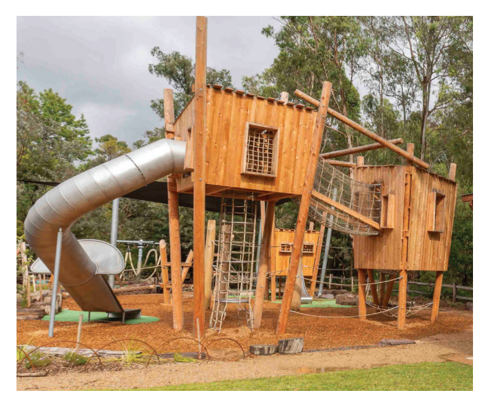
wonguim wilam Park, Warrandyte. Wurundjeri Country.